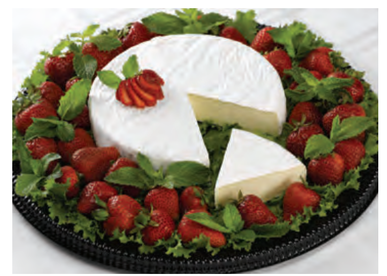
Brie and Strawberries 1 Kilo Simply Enjoy Brie and strawberries. Serves 10–12