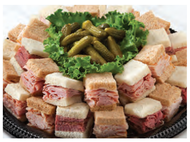
Finger Sandwiches 36 Tea Sandwiches -12 each of Roast Beef, Honey Ham and Smoked Turkey. Served on White or Wheat Bread with Pickles. Serves 10-15