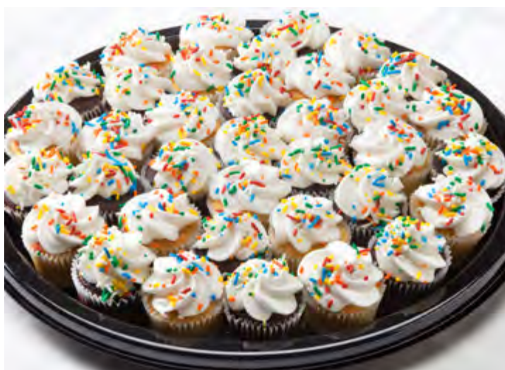
36 ct Mini Cupcake Tray Assorted varieties. Serves 12-15