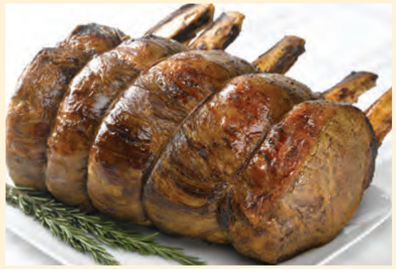
Beef Rib Roast Sold by the pound. (Uncooked) Available in USDA Choice Beef or USDA Choice Certified Angus Beef®.

Available in USDA Choice Beef or USDA Choice Certified Angus Beef®.