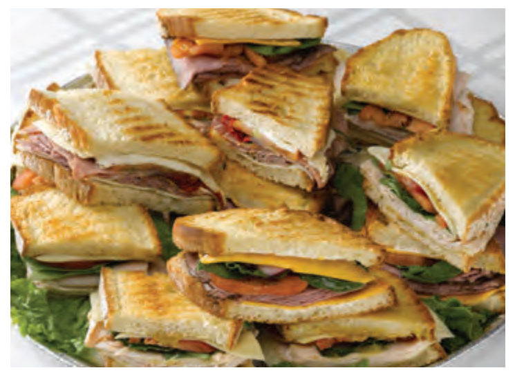
Panini Platter-Available in Select Stores Choose up to 3 varieties: Reuben, Italian, Turkey and assorted varieties. Medium (5 large Panini Sandwiches cut in thirds) Serves 6–10