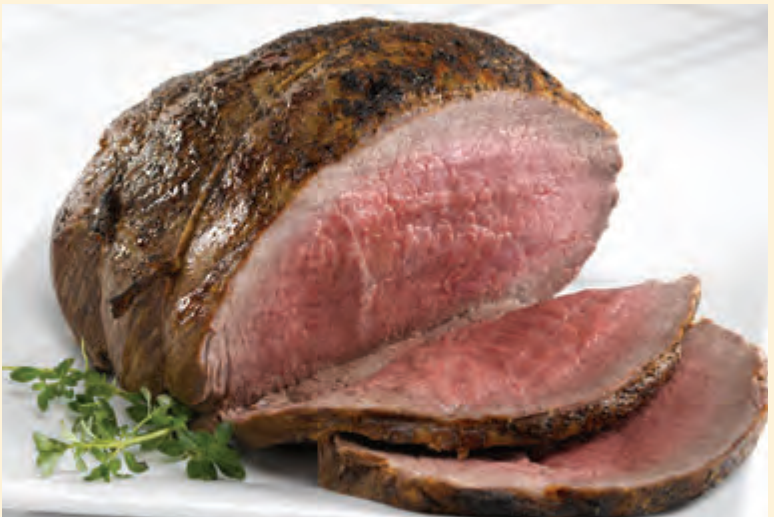
Petite Sirloin Roast Sold by the pound. (Uncooked) Available in USDA Choice Beef or USDA Choice Certified Angus Beef<sup>®</sup>.