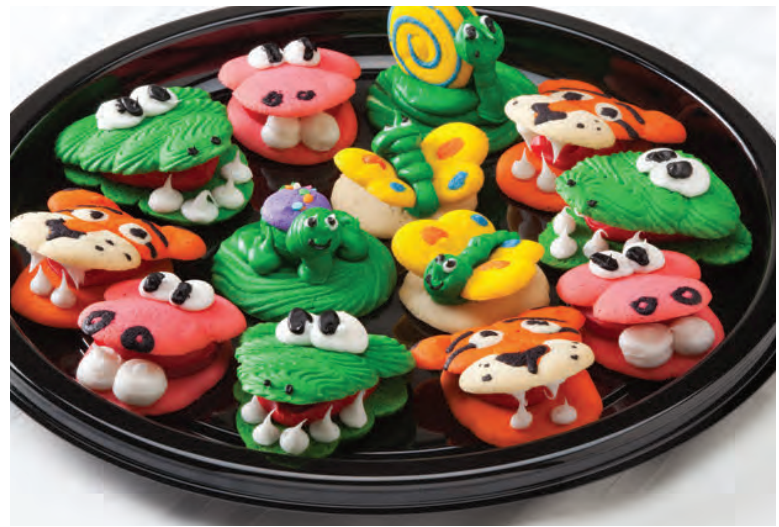
Character Cookie Platter Fun character cookies. Serves 8-10

Mini Pastry Platter A delicious selection of miniature French Pastries and assorted Cake Slices. Perfect for your Holiday Party or Buffet. Serves 25