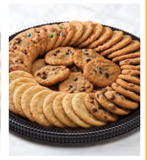
Large Cookie Platter Choose from Candy, Peanut Butter, Sugar, Oatmeal Raisin and Chocolate Chip. Serves 19–25

Choose from Inple Chocolate, White Macadamia, Peanut Butter, Chocolate Chunk and Oatmeal Raisin. Serves 24