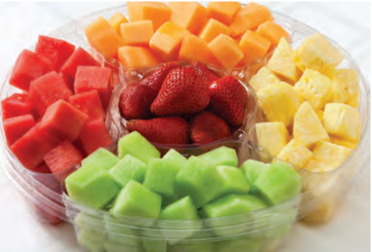
Fresh Cut Fruit Platter Cantaloupe, Honeydew, Pineapple and Strawberries. (Fruit may vary by season) 42 oz Size Serves 4-5 80 oz Size Serves 8-10

Flaky shortbread crust filled with custard and Topped with fresh fruit and glaze. Serves 8-10