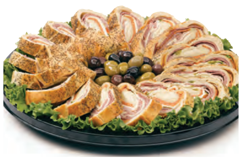
Suprimo Savory bread filled with Italian meats and cheeses. Serves 10–12

Let's Twist Sandwich Platter 24 Mini Twisted Roll Sandwiches. 8 each of Roast Beef, Honey Ham and Turkey Breast Sandwiches served on Mini Twisted Rolls served with Pickles. Serves 10–15 Available with Boar's Head® Brand Meats and Cheeses for an additional charge.