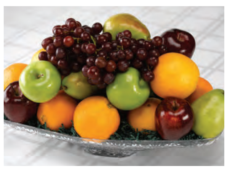
Festive Favorite Gondola 19 pieces of extra fancy fruit.