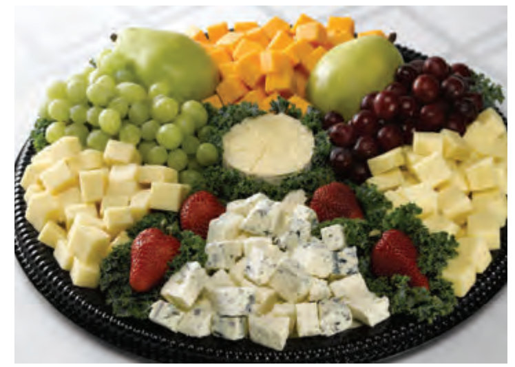
Assorted Cheese Entertainer Imported Blue, Mini St. Andre, choice of Danish Havarti, Sharp Cheddar White and Yellow, red grapes, green grapes, whole pears and strawberries. Serves 18–20

Fresh mozzarella cheese slices layered between slices of vine ripe tomatoes and fresh basil. Served with extra virgin olive oil. Serves 12–15