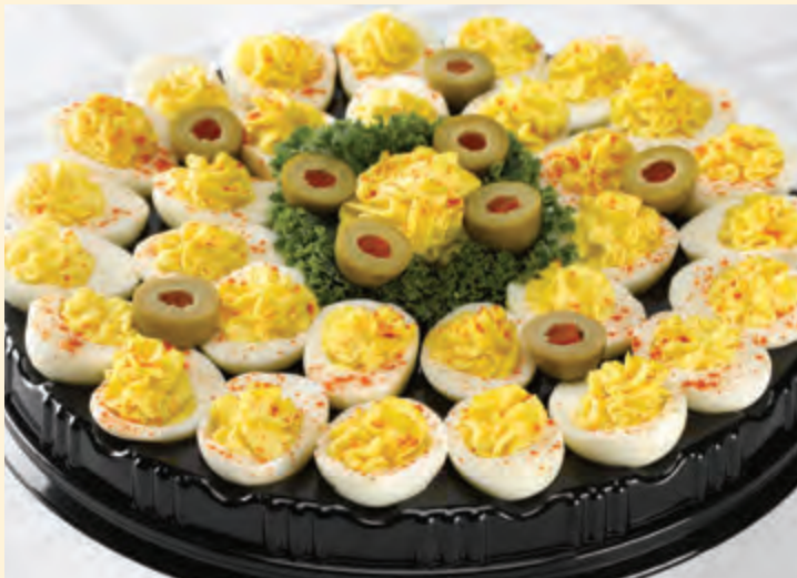
Deviled Egg Tray Deviled egg halves on a platter. Serves 10–15 (30 ct tray)

Bread Boule Pumpernickel bread boule filled with spinach dip.