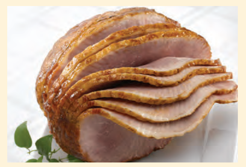
Spiral Sliced Ham Sold by the pound. (Fully cooked, heat & serve)