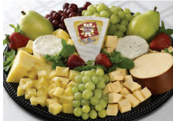
Cheeses of the World Jarlsberg, Double Créme Brie, Smoked Gouda, Boursin Garlic and Herb, pears, strawberries and grapes (red and green). Serves 18–20