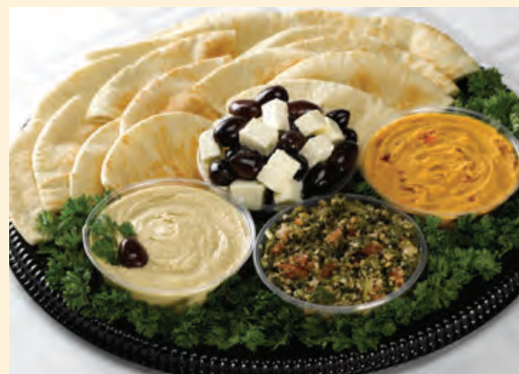
Mediterranean Platter Taboule, Original and Red Pepper Hummus, Kalamata Olives, Feta Cheese Salad, Pita Pieces. Serves 12-15

Dip Ahoy Platter Fresh Caulifower, Broccoli, Carrots, Celery Sticks, Peppers, Cherry Tomatoes and Cucumbers. Served with Sour Cream Dip or Yogurt Dip. Small Serves 10-12 Large Serves 20-25