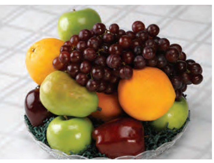
Traditional Fruit Tray 14 pieces of extra fancy fruit.