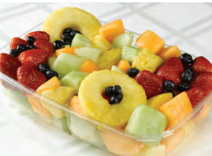
Fresh Luau Bowl Cantaloupe, Honeydew, Pineapple, Strawberries, Red Grapes and Blueberries. (Fruit may vary by season) Serves 5–7

Sliced Fruit Tray Honeydew Melon, Cataloupe Melon, Pineapple, Strawberries, Watermelon, Orange and Kiwi Slices, Red Grapes and Seedless Green Grapes. Medium Serves 10-12 Large Serves 20–25