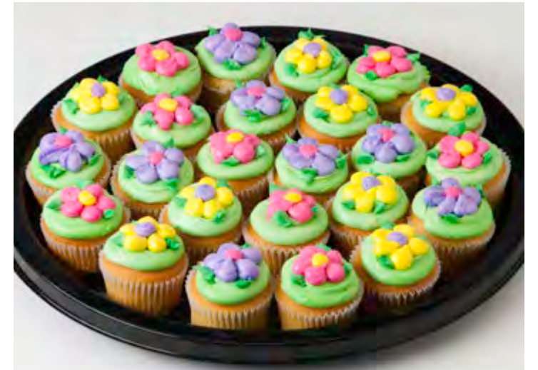
24 ct Cupcake Tray Assorted varieties. Serves up to 24