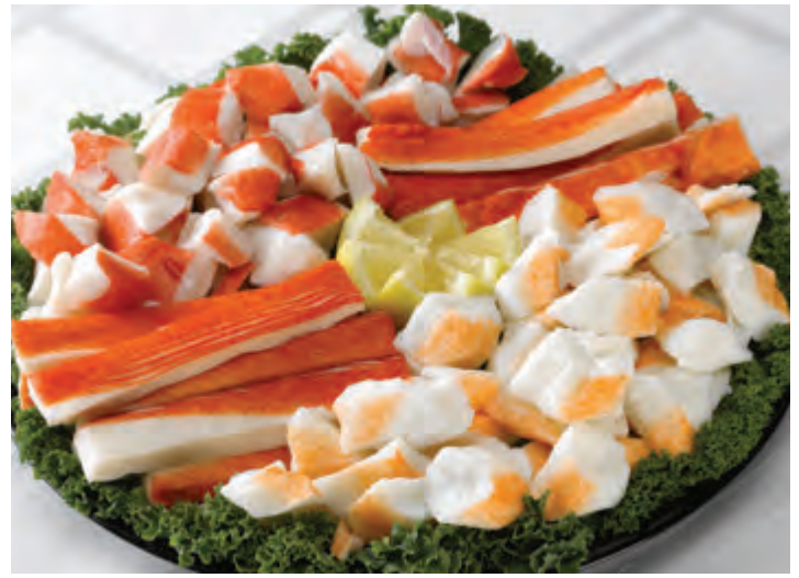
Imitation Lobster and Crabmeat Platter 3 lbs of imitation crab and imitation lobster meat. Serves 10–12

Available in four Cooked Shrimp sizes: 51/60 Medium Large Shrimp, 31/40 Extra Large Shrimp, 26/30 Jumbo Shrimp and 16/20 Colossal Shrimp.