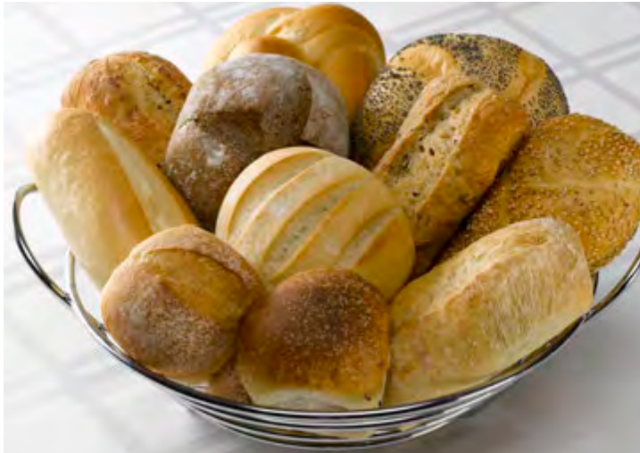
Fresh-Baked Rolls We have fresh-baked rolls and breads to accompany your deli trays.

Condiment Tray Leaf Lettuce, Sliced Tomatoes, Red Onions, Bread & Butter Pickles, Mayonnaise and Plain, Brown or Honey Mustard. Garnished with Pepperoncini Peppers. Serves 10-15