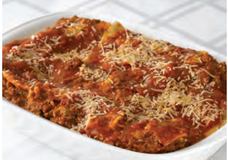
Lasagna with Meat Sauce Lasagna noodles layered with ricotta, mozzarella and imported Parmesan with Bolognese meat sauce. Serves 10–12 Heat and Serve.

Tender pasta shells generously stuffed with three authentic Italian cheeses: creamy ricotta, Pecorino Romano and mozzarella, served in a rich tomato sauce. Serves 10–12 Heat and Serve.